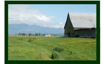
Preservation of Mount Vernon's heritage and protection of farmland is important to the quality of life for everyone.